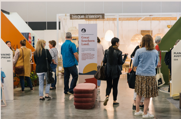
Pictured : The Neighbourhood, Great Southern Land - Sydney 2021