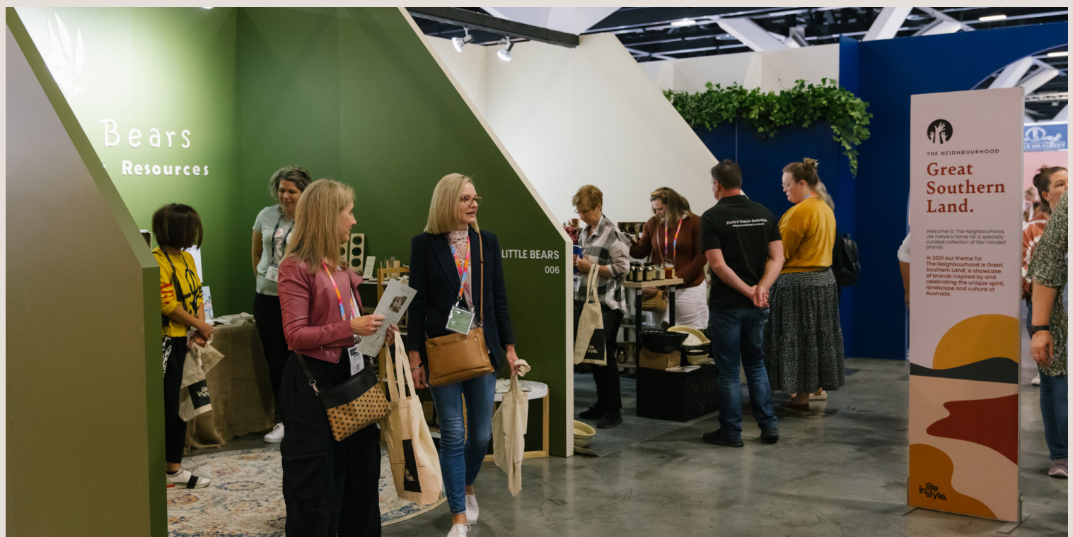
The Neighbourhood, Great Southern Land – Sydney 2021